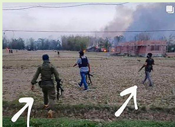
[Narco-terrorists attacking civilians on May 3, 2023]

Who are responsible for the threat? Government of India remains lagging far behind in providing complete protection of the Manipur sector of the Indo-Myanmar boundary from cross-border narco-traders and contraband drugs. Taking advantage of this lagging/ weakness narco-business has been carried out extensively by a collusion of market forces in which cross-border narco-terrorists plays the most dominating and aggressive role. Heavily armed narco-terrorist organisations, who are ( allegedly protected by Government of India