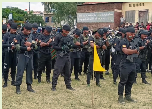
[Kuki-Chin-Zomi militants brandishing sophisticated weapons on India's Independence Day, at Churachandpur]

It is high time that the people of India joins hand to Save Manipur: Save India from narco-terrorism.